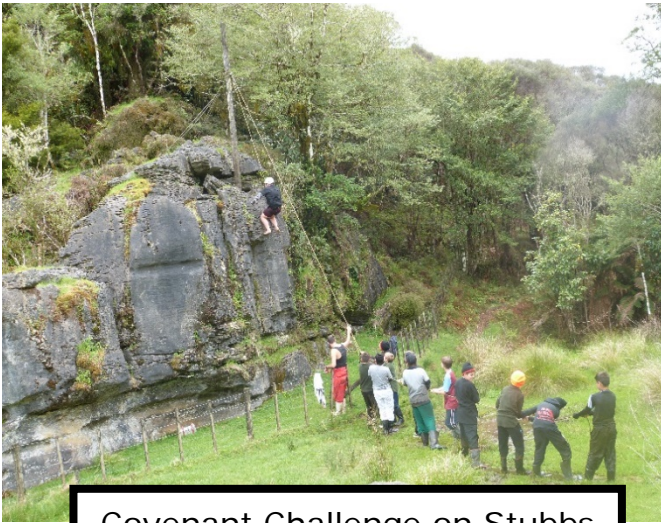
Covenant Challenge on Stubbs Farm at Waitomo

Please note: Students who do not end up going on camp will not be given a fundraising refund.