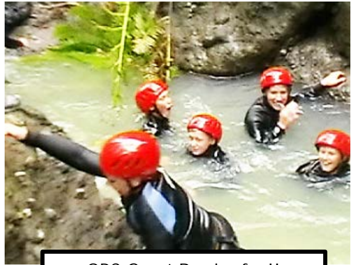
OPC Great Barrier fun!!

Parents who wish to pay for their child's camp through direct credit instalments may do so by depositing funds into ASB bank account: 12-3217-0017704-00 Please use student name and 'camp' as reference.