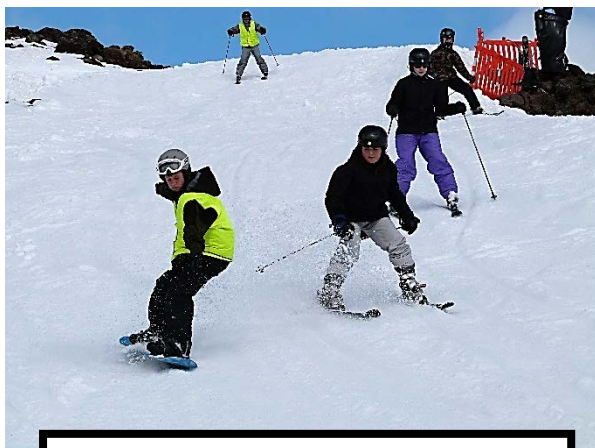
Students on the snow at Alpine camp.